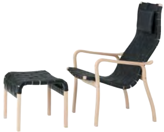
Primo easy chair, high back