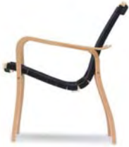
Primo easy chair, low back