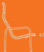
Melano easy chair