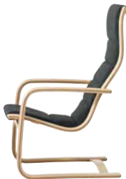
Lamello easy chair