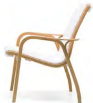
Laminett easy chair

Ur Yngve Ekströms rika produktion, ett urval möbler som fortfarande produceras av Swedese: