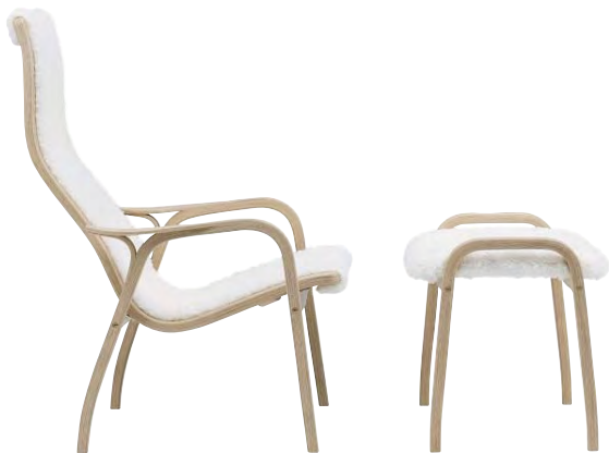
Lamino easy chair, stool