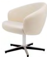
Rondino swivel chair