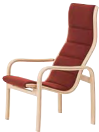
Melano easy chair