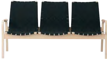
Primo sofa, low back